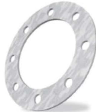
Colour - Orange