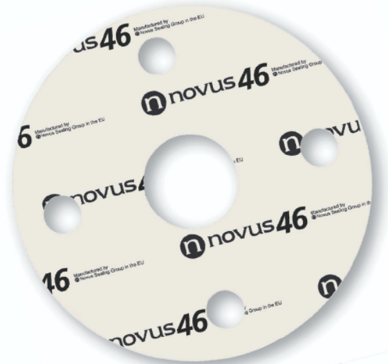
Colour - White