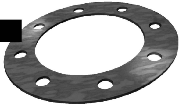
Colour - Black